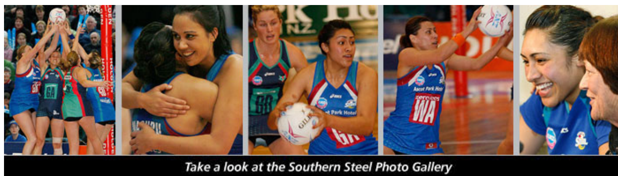
Take a look at the Southern Steel Photo Gallery

Another trans-Tasman battle looms for the Ascot Park Hotel Southern Steel when it takes on West Coast Fever at 7pm on Monday, June 16, at the Edgar Centre in Dunedin